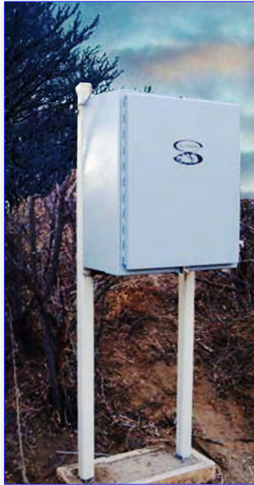
Station Enclosure & Base Civil Works

Installation of an Accubar Bubble Gage/Recorder Station at Sorrie Canal, a diversion from the Gallinas River, New Mexico