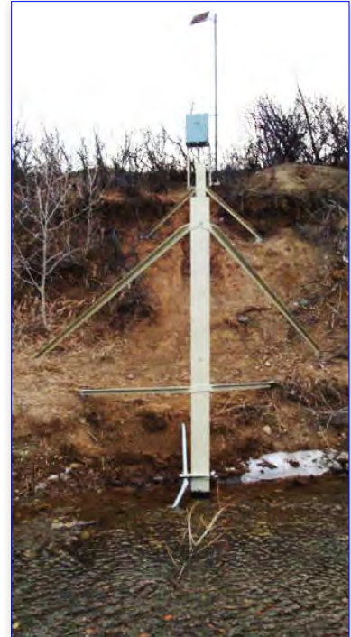
Back Side of Metal Brace for Lower Staff Gage