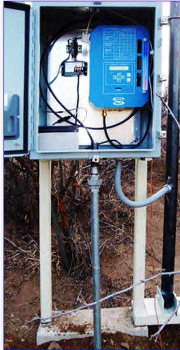
Bubbler & Orifice Line