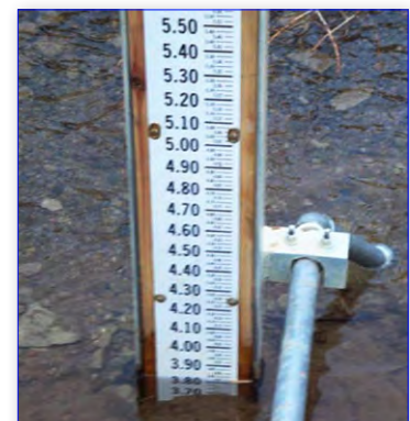
Lower Staff Gage